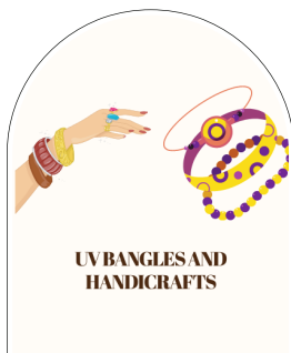
UV Bangles and Handicrafts Founder - Urmila