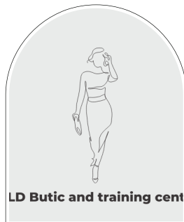
LD Butic & Training Centre Founder - Nisha